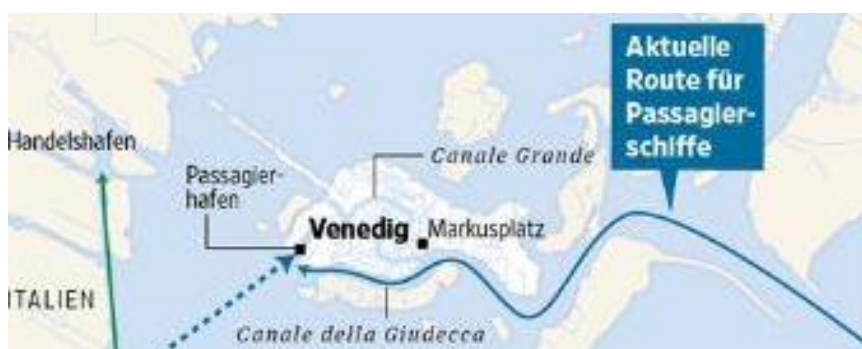
Figure 3: Current route of the passenger ships in Venice (Legorano,2013)

As mentioned above, cruise tourism and therefore the shore leave of passengers is of great importance for Venice. The 21st of September in 2013 is the most important day in the city's history: the city almost collapsed on that day because of the masses of tourists. A total of 12 cruise ships with a total of 20,000 passengers moored in the port. In addition, there were the 60,000 tourists already present who did not arrive by ship (Machatschek, 2014:19). The increase in the number of cruise passengers is enormous. Unlike the ports of Civitavecchia near Rome or Livorno near Florence, in Venice ships dock directly in the city. Figure 1 in the appendix shows the various options for mooring the ships. The cruise ships reach the port via the Giudecca Canal and return to the Mediterranean Sea. To get back into the sea from the port "Stazione Marittima", the ships have to sail directly past the historic old town and St. Mark's Square.