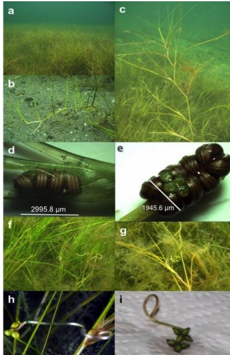
Figure 3. Ruppia filifolia in Skyring Sound, Magellan region. a) Natural meadow, b) apical section of horizontal rhizome, c) vertical stem, d) inflorescence partly wrapped by leaf sheaths, e) inflorescence with two flowers, four peltate stigmas are seen between the two reniform anthers of the distal flower, f-g) inflorescence with curved stalk, h-i) inflorescence with ovoid fruits without pedicel.

separate taxon with a mixture of characters from R. cirrhosa (Petag.) Grande and R. maritima L. according to the descriptions provided by Gamarro (1968) for those taxa. The molecular phylogenies of Ruppia (Ito et al. , 2010, 2013) reveal that R. filifolia is close to R. maritima albeit maintaining significant differences with other taxa of the genus. Consequently, we support Moore's (1983) proposal of maintaining the status of R. filifolia as a separate taxon until in-depth morphological, caryological and phylogenetic analyses are completed on a comprehensive collection of specimens from all localities where this taxon is found. Meanwhile,