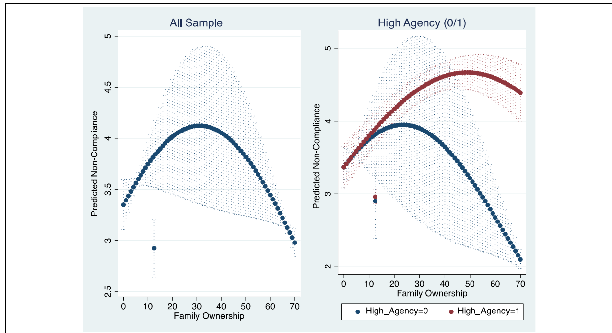
Figure 3. An inverted U-shaped effect of family ownership on noncompliance.

with the codes' recommendations. At the same time, an increase in institutional investors (measured by their shares in the firm) decreases the level of noncompliance. This result not only corroborates prior governance literature on the role of institutional investors as watchdogs in governance matters (Almazan, Hartzell, & Starks, 2005) but also points out that different shareholders tend to balance their interests when affecting the firms' governance practices choices.