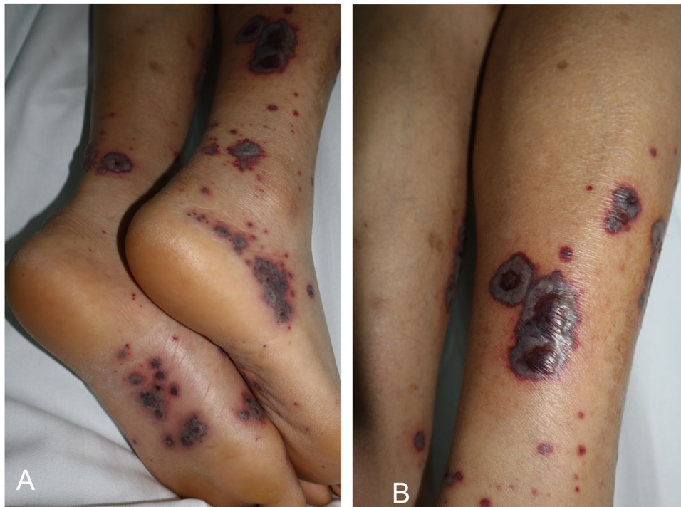
Fig. 1. Purpuric lesions on the lower limbs.

c Pathology, Hospital Universitari Son Espases, Palma, Mallorca, Spain