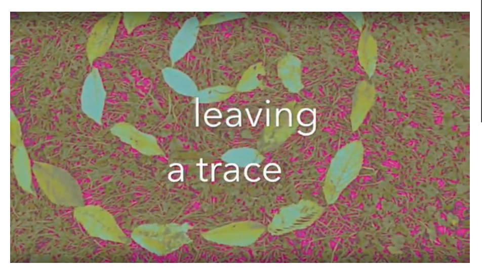
Fig. 2. PartSuspended, SPIRALS: Breath (London, Dorset, Athens, Agost), 2021, https://youtu.be/YfvSeDlZkUE, © PartSuspended.

The complete 2020 lockdown in the UK coincided with the coming of Spring and many of us relieved our isolation by spending time outside. Walking, or in the garden, I became acutely aware of the prevalence of the spiral form in nature: the scales on a pine cone, the formation of leaves or petals on a stem, the curl of a snail shell, the twist of a vine, the Fibonacci series at the centre of every daisy and the uncoiling tendrils of a fern. As time went on, I made new spirals out of existing spiral forms: a whorl of empty snail shells, a curl of cones: spirals within spirals. As part of PartSuspended's process, we shared our spiral images; our many natural versions of this form and this sharing connected our different experiences. The spiral form held us together and when one or other of us became too tightly coiled and turned in on ourselves, it repeatedly demonstrated the possibility of movement and growth. (Bridger, Personal note)