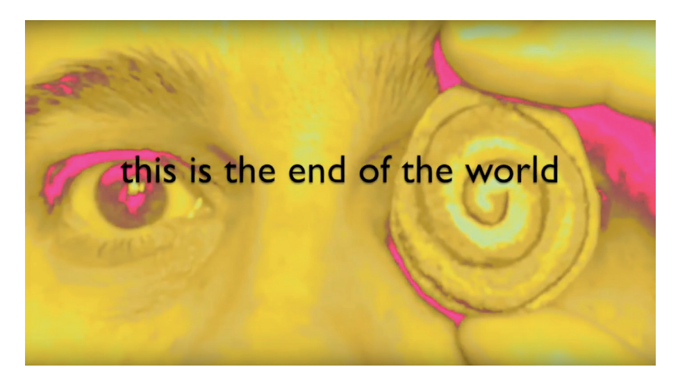
Fig. 3. PartSuspended, SPIRALS: Turning Points (London, Dorset, Athens, Agost), 2020, https://youtu.be/Vcp4Dt4_e_Y, © PartSuspended.