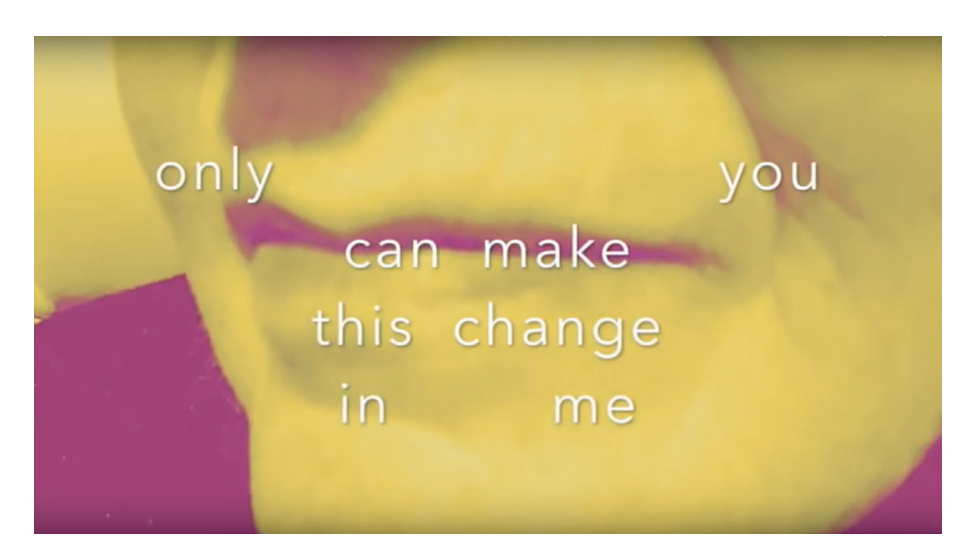
Fig. 4. PartSuspended, SPIRALS: Breath (London, Dorset, Athens, Agost), 2021, https://youtu.be/YfvSeDlZkUE, © PartSuspended.

This sense of uncertainty mentioned above, inevitably fragmented the basis of the existing structure of the PartSuspended collective and their particular experiences as female subjects. The discontinuity inherent in the female